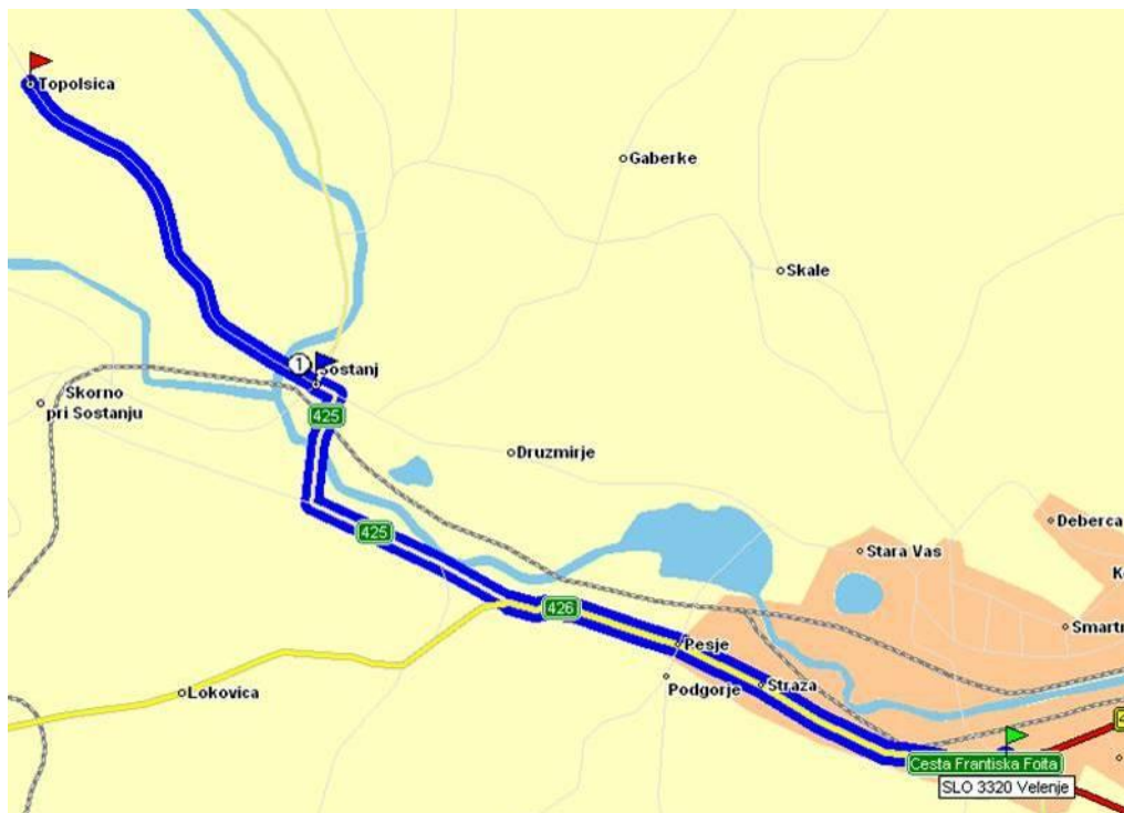
How to get to Šoštanj? http://www.sostanj.si/