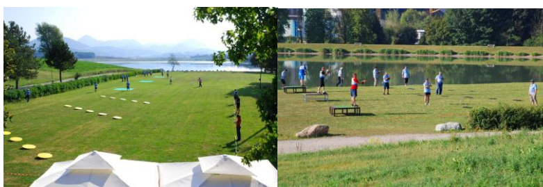
Fishing home (New casting competition center)